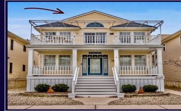
3030 ASBURY AVENUE OCEAN CITY, NJ Top Floor 3 Bedroom with Rooftop Deck