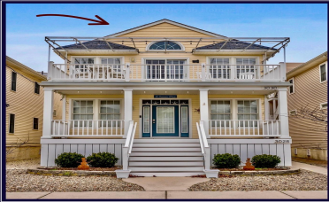
3030 ASBURY AVENUE OCEAN CITY, NJ Top Floor 3 Bedroom with Rooftop Deck