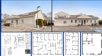
2004 BAYSHORE RD. VILLAS, NJ