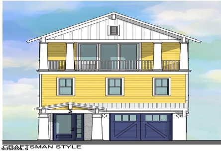
55MCM3 CRAFTSMAN STYLE