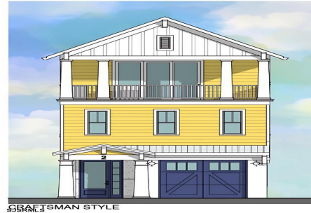
55MCM3 CRAFTSMAN STYLE