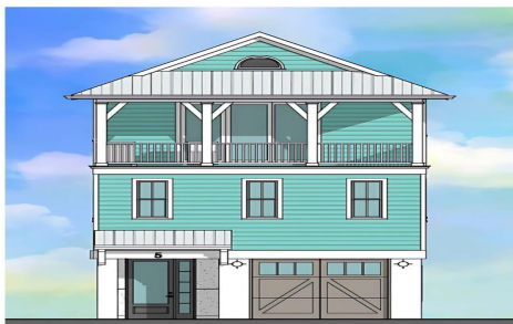
CRACKER STYLE SJSRML.S