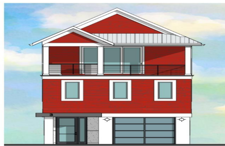
SEASHORE MODERN STYLE