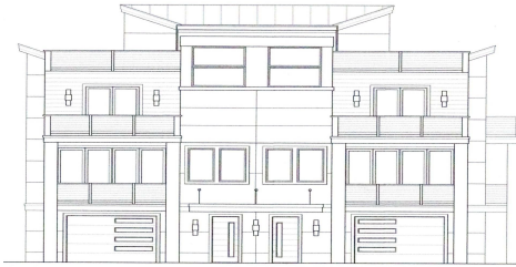
NEWARK AVENUE ELEVATION