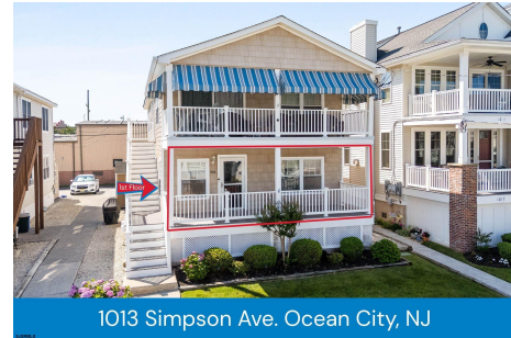
1013 Simpson Ave. Ocean City, NJ