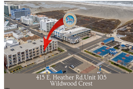
415 E. Heather Rd. Unit 105 Wildwood Crest