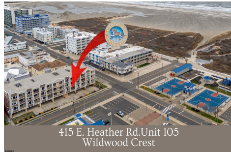
415 E. Heather Rd. Unit 105 Wildwood Crest