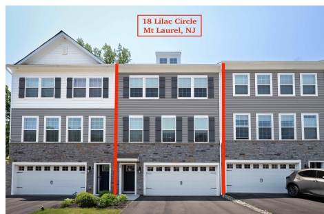
18 Lilac Circle Mt Laurel, NJ