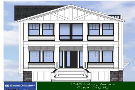
1549 Asbury Avenue Ocean City, NJ