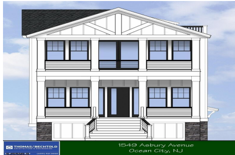
1549 Asbury Avenue Ocean City, NJ