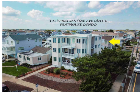
101 W BRIGANTINE AVE UNIT C PENTHOUSE CONDO