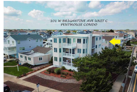
101 W BRIGANTINE AVE UNIT C PENTHOUSE CONDO