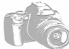
PHOTO NOT AVAILABLE