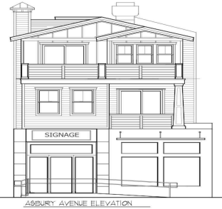
ASBURY AVENUE ELEVATION