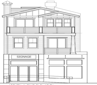
ASBURY AVENUE ELEVATION