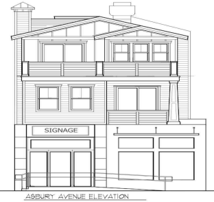
ASBURY AVENUE ELEVATION