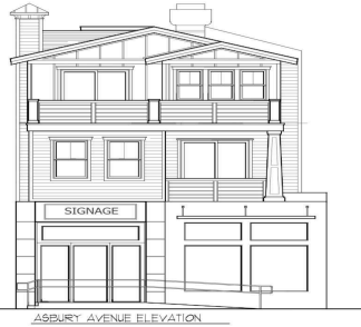
ASBURY AVENUE ELEVATION