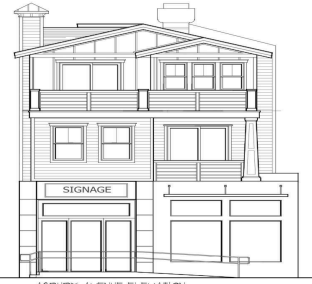
ASBURY AVENUE ELEVATION