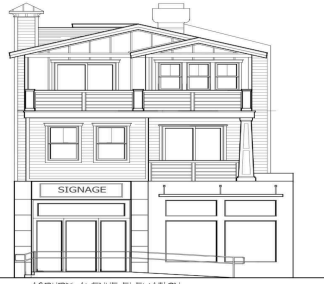
ASBURY AVENUE ELEVATION