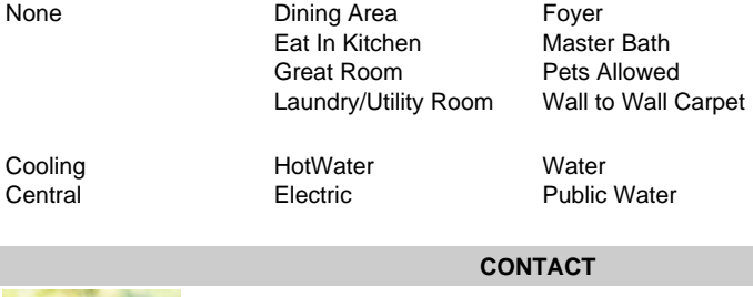
Scan to see Property page.