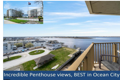
Incredible Penthouse views, BEST in Ocean City!