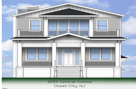
1634 Central Avenue Ocean City, NJ