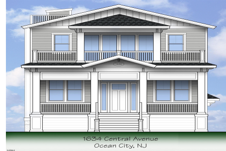
1634 Central Avenue Ocean City, NJ