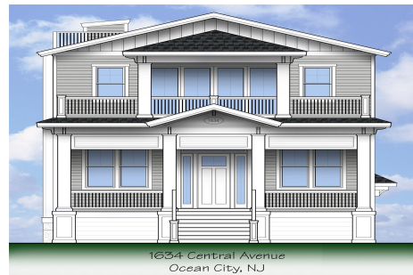
1634 Central Avenue Ocean City, NJ