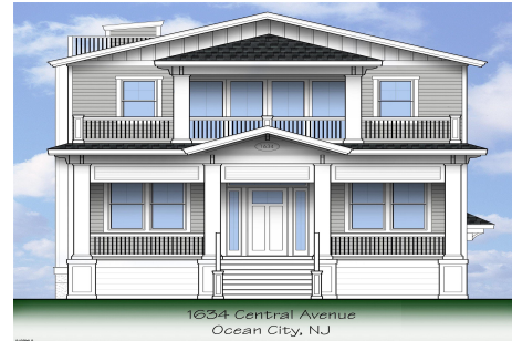
1634 Central Avenue Ocean City, NJ