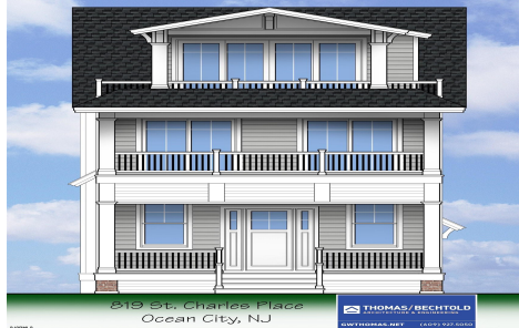
819 St. Charles Place Ocean City, NJ