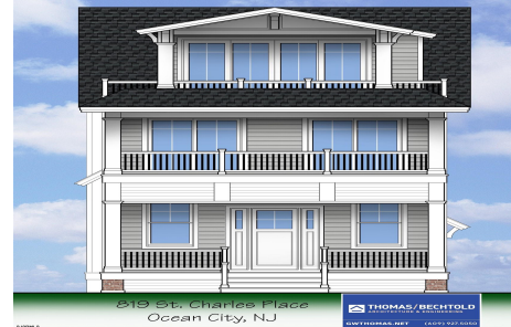
819 St. Charles Place Ocean City, NJ