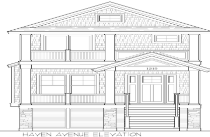
HAVEN AVENUE ELEVATION