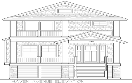
HAVEN AVENUE ELEVATION