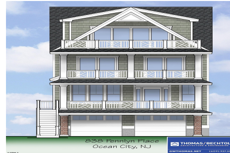
838 Pennlyn Place Ocean City, NJ