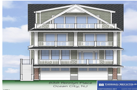
838 Pennlyn Place Ocean City, NJ