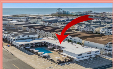
2101 Surf Avenue North Wildwood, NJ Beach Block 1 Bedroom Condominiums