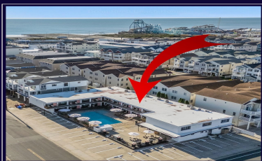
2101 SURF AVENUE NORTH WILDWOOD, NJ Beach Block 1 Bedroom Condominiums