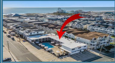
BEACH HOUSE OF NORTH WILDWOOD CONDOMINIUMS 2101 Surf Avenue North Wildwood, NJ