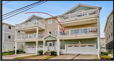
3 BEDROOM WITH POOL 422 W Hand Ave #102 Wildwood, NJ