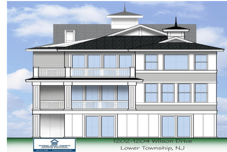
1204-1204 Wilson Drive Lower Township, NJ