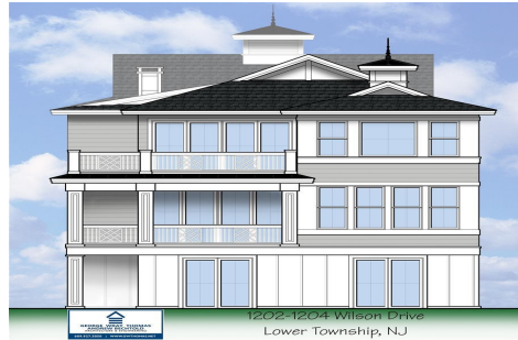
1204-1204 Wilson Drive Lower Township, NJ