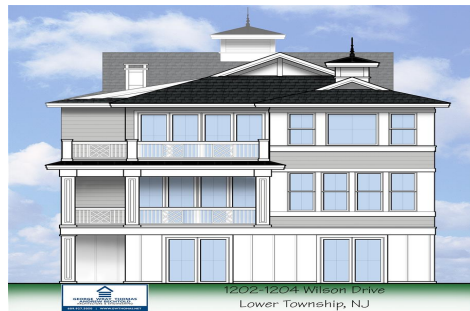
1204-1204 Wilson Drive Lower Township, NJ