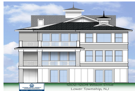
1204-1204 Wilson Drive Lower Township, NJ