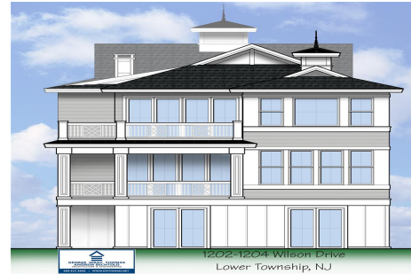
1202-1204 Wilson Drive Lower Township, NJ