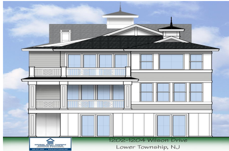
1202-1204 Wilson Drive Lower Township, NJ