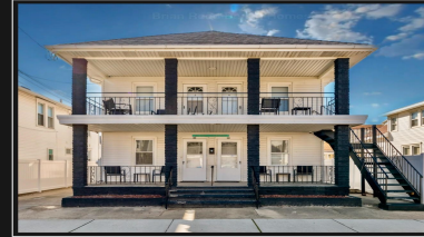
238 E LEAMING WILDWOOD, NJ 6 Unit Apartment all with 2 Bedroom