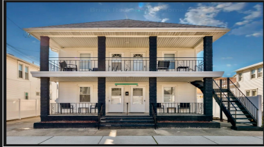
238 E LEAMING WILDWOOD, NJ 6 Unit Apartment all with 2 Bedroom