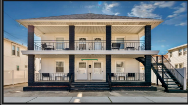
238 E LEAMING WILDWOOD, NJ 6 Unit Apartment all with 2 Bedroom