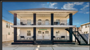
238 E LEAMING WILDWOOD, NJ 6 Unit Apartment all with 2 Bedroom