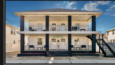
238 E LEAMING WILDWOOD, NJ 6 Unit Apartment all with 2 Bedroom