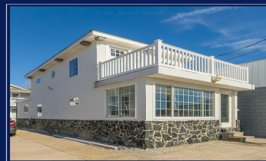
123 E Lincoln Avenue Wildwood, NJ 3 Bedroom 2 Bath Single Family