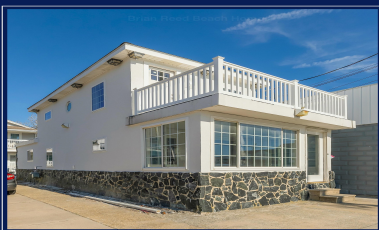
123 E Lincoln Avenue Wildwood, NJ 3 Bedroom 2 Bath Single Family