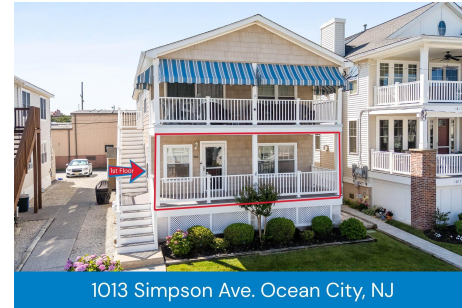
1013 Simpson Ave. Ocean City, NJ