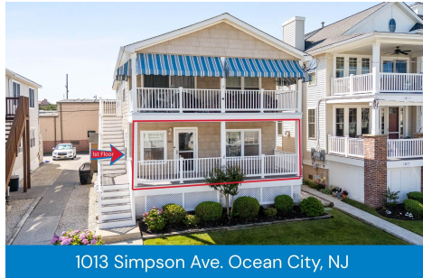
1013 Simpson Ave. Ocean City, NJ