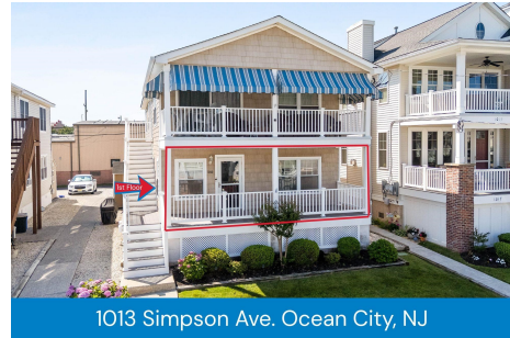
1013 Simpson Ave. Ocean City, NJ