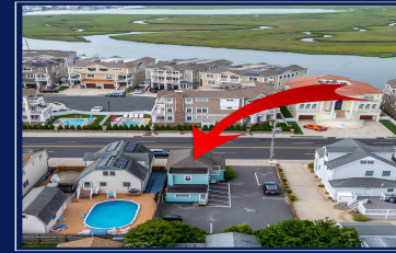
413 W SPRUCE AVENUE, NORTH WILDWOOD Commercial and Residential Property with 7 car parking