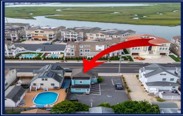
413 W SPRUCE AVENUE, NORTH WILDWOOD Commercial and Residential Property with 7 car parking