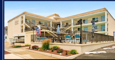
417 E 22ND #101 NORTH WILDWOOD White Sails Condominiums - Beach Block