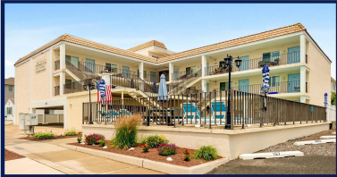
417 E 22ND #101 NORTH WILDWOOD White Sails Condominiums - Beach Block