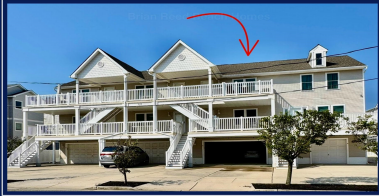
328 E 25TH AVENUE #C NORTH WILDWOOD, NJ