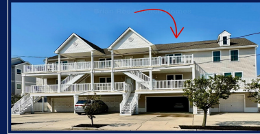
328 E 25TH AVENUE #C NORTH WILDWOOD, NJ