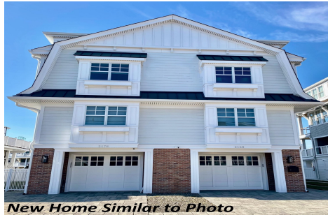
New Home Similar to Photo