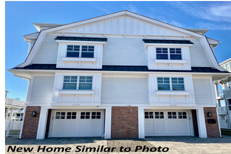
New Home Similar to Photo