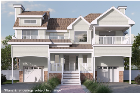
*Plans & renderings subject to change