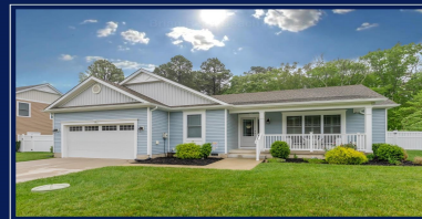
19 CANTERBURY WAY Cape May Court House, NJ