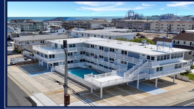
2001 Surf Avenue North Wildwood NJ Surf Avenue Suites