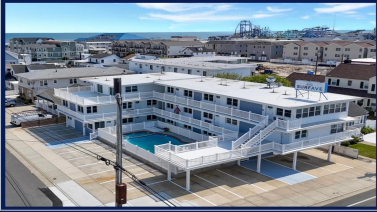
2001 Surf Avenue North Wildwood NJ Surf Avenue Suites