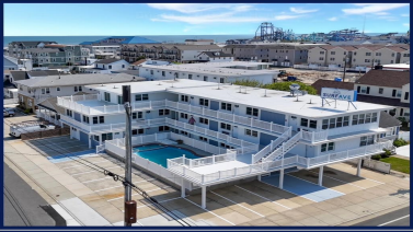
2001 Surf Avenue North Wildwood NJ Surf Avenue Suites