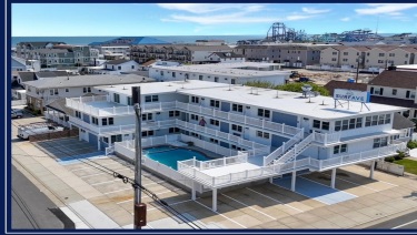
2001 Surf Avenue North Wildwood NJ Surf Avenue Suites