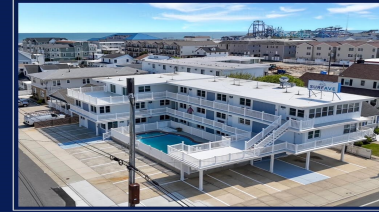
2001 Surf Avenue North Wildwood NJ Surf Avenue Suites