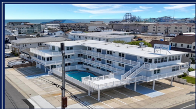
2001 Surf Avenue North Wildwood NJ Surf Avenue Suites