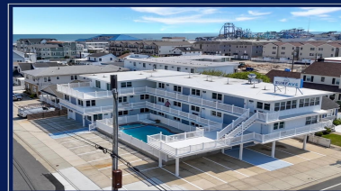
2001 Surf Avenue North Wildwood NJ Surf Avenue Suites