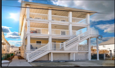
138 E YOUNGS WILDWOOD, NJ Penthouse Unit 3