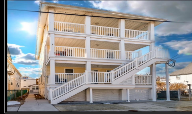
138 E YOUNGS WILDWOOD, NJ Penthouse Unit 3