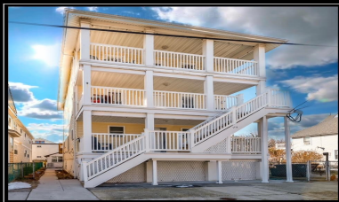
138 E YOUNGS WILDWOOD, NJ Penthouse Unit 3