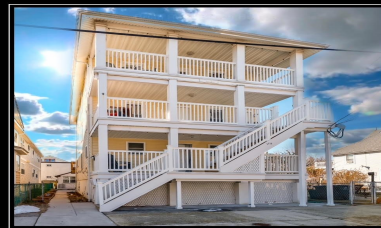
138 E YOUNGS WILDWOOD, NJ Penthouse Unit 3